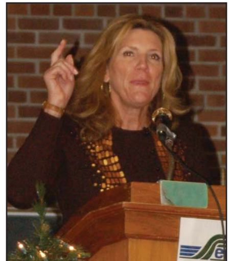
Senator Julie Rosen spoke with Federated members about energy legislation coming from the state energy committee she chairs; she also shared her 2012 outlook. 🙏