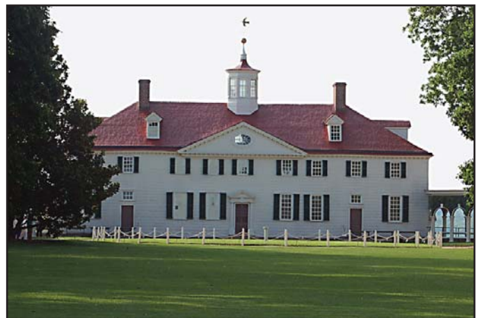
Teens: if you ever wanted to see Mount Vernon, now is your chance! The winner of Youth Tour will see many historic sites in Washington, D.C. Apply today!

See Page 4 for details on how to enter the contest. ⚡