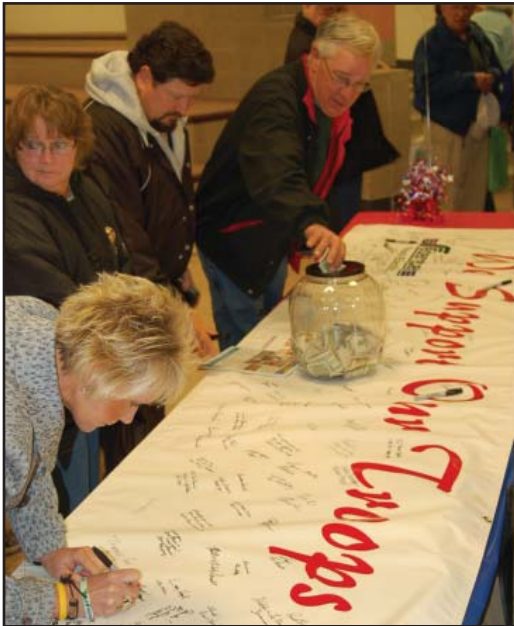
Federated members attending the Annual Meeting signed the Troops Banner and made donations as well. You're invited to sign it too!

Stop in the office through December and sign our "Troops Banner." This banner will be sent to our national guard troops, which are deployed. Also, make a donation (Federated will match it) with all funds going to care packages for our troops. What a great project our employees have undertaken!