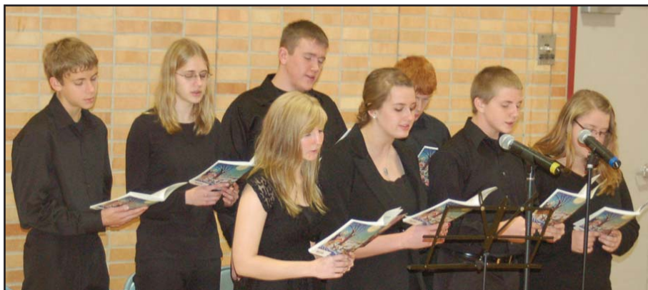
“Good tidings we bring to you and your kin...” The Martin County West Show Choir performed holiday tunes for the crowd during Annual Meeting registration. Bravo!